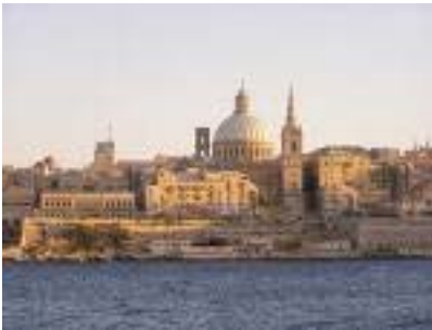
looking across the water to Valletta

The hotel had a policy. They are supporters of the Malta Heritage Trust and asked all visitors to (voluntarily) contribute €1 per day on their bill which would be passed on to the Trust – an independent non-government body, self funding, and restores and runs various heritage projects.