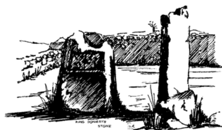
King Doniert's Stone – site managed by the Trust for EH

The English Heritage annual inspection proved very satisfactory and we have completed a Health and Safety Report on each EH site as is now required.