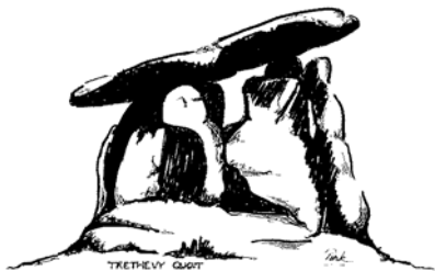
Trethevy Quoit – site managed by the Trust for EH