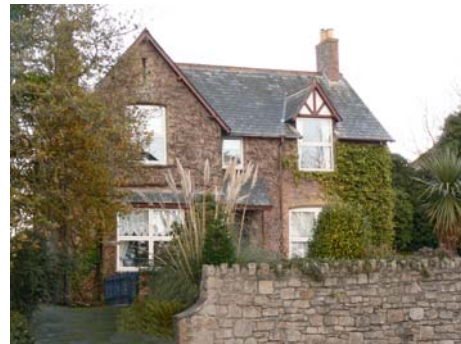
St Mary's Vicarage, Par 1882

There were also a dozen hotels or large additions to hotels; and when financial backing was lacking, he floated his own hotel companies to fund them. He was also responsible for the design of 11 churches or chapels; 28 large houses and 4 major add-ons; 11 banks; 8 libraries & institutes in conjunction with John Passmore Edwards; 5 hospitals & nursing homes, 14 commercial premises or developments, 17 public rooms, clubs, post offices etc, 10 housing developments and estates, and several sets of workingmen's dwellings.