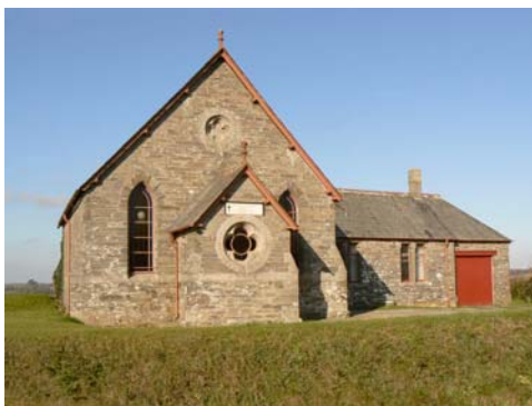
Helland Wesleyan Chapel built in 1878 still in use

He was active in local affairs for 17 years; elected to Truro Council in November 1886, he was Mayor 1894/5 and continued as a Councillor until 1903. He was elected a member of the newly formed Cornwall County Council in 1889 and continued until 1901. He drafted the Council's Standing Orders and was Chairman of the County Sanitary Committee, where he campaigned vigorously to improve the public health of Cornwall. He was appointed to the prestigious and lucrative post of Architect to the County Lunatic Asylum.