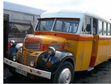
route 18 looking splendid

Just outside the gateway to the old city is a massive roundabout which is the bus station for the island and is a hub of intense activity. The buses on Malta are very special. They are all single deckers and splendid in their colours of orange, red and white, and they range from ancient examples of very early design right up to modern day streamlined elegance.