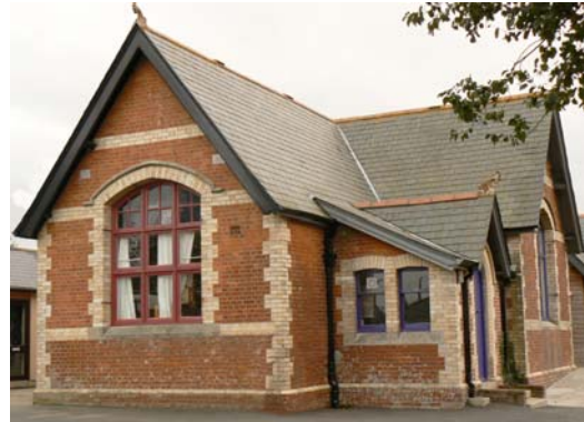
St Just Board School opened 1894 now retail premises

inquest the verdict was that his mind was 'unhinged'; he was buried in the family plot under the Celtic memorial cross.