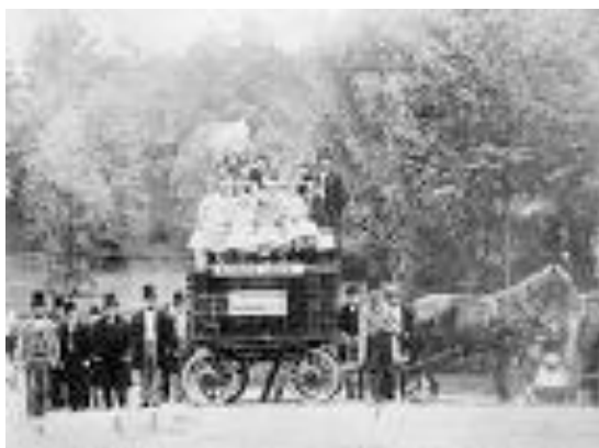
The Mammoth Cheese of 1866 Standing on top of the cheese are 9 adults and 9 children!