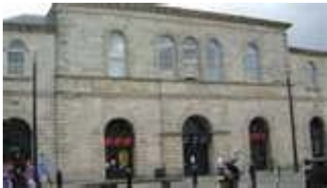
Hall for Cornwall

The illustrations, mostly historic photographs and maps, greatly add to the value of the book. In many ways, one feels, we are lucky that Truro has managed to preserve as much of its former character and admirable buildings as it has.