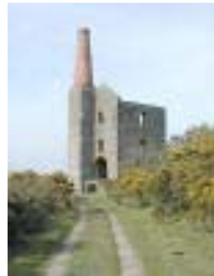
Prince of Wales Shaft Phoenix United Mine

9. Caradon. This is a windswept rugged landscape on Bodmin Moor where you can visit Cheeswring, Minions Heritage Centre, The Prince of Wales Shaft at the Phoenix United Mine and Liskeard Museum.