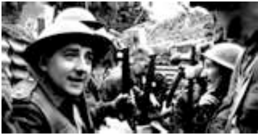
The Somme trenches – WW2 Battlefields Tour

If you are interested please contact the Chairman, through the Trust's Office, who will be the link contact with the Battlefields Trust.