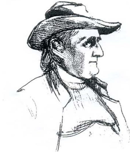
Robert Stephen Hawker

He was also a passionate writer on Arthurian themes, earning plaudits from the Poet Laureate, Alfred Lord Tennyson, for his ‘Quest of the Sangraal’ a long mystical poem – possibly written under the influence of opium – Tennyson admitting that ‘Hawker has beaten me on my own ground.’ RSH’s ‘Cornish Ballads’ and his ‘Footprints of Former Men in Far Cornwall’, dealing with North Cornwall characters and legends, are collectors items these days.