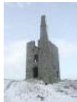
Greenburrow engine house

2. Hayle. Taking its name from heyl, the Cornish word for estuary, the sites include Black Bridge, Harvey's Foundry Barn and Carsnew Pool.